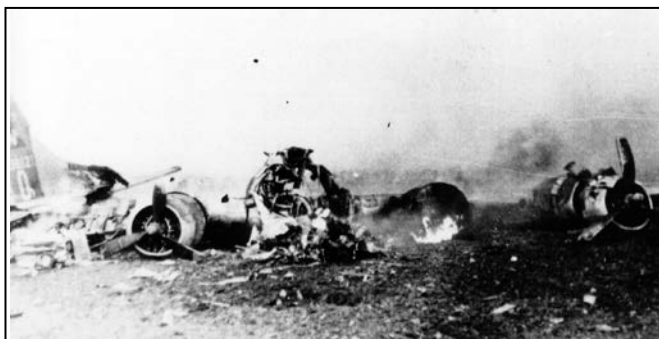
There was not a lot left of poor "Queenie" after crash landing at Paderborn April 13, 1945. Joe and the Traeder Crew were lucky to survive that one!

The tight formation, which served to protect the fleet during runs, now proved calamitous. Six planes were taken out, including Queenie, which lost two of its four engines in the explosion and was careening toward a crash landing behind enemy lines. An airfield spotted in the distance seemed the crew's only salvation, but it proved too far for the rapidly